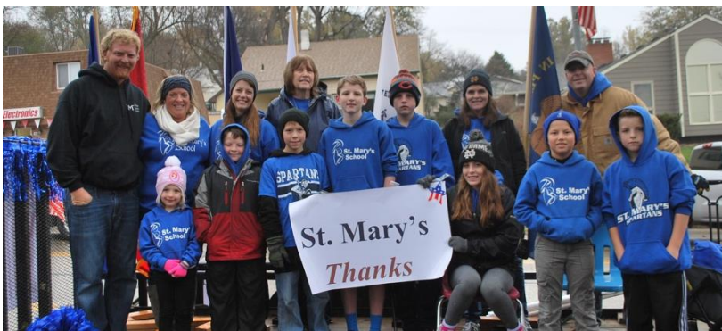
Veterans Day Parade