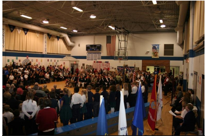
Veterans Day Assembly