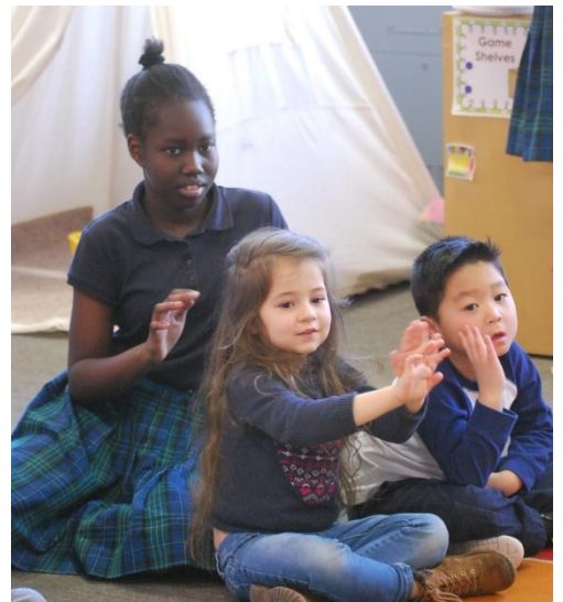
PK and 5th grade students celebrate Thanksgiving with their own feast.