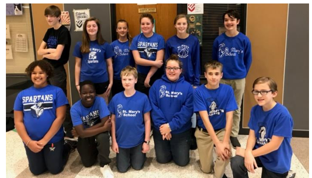
Witslash – Academic Bowl