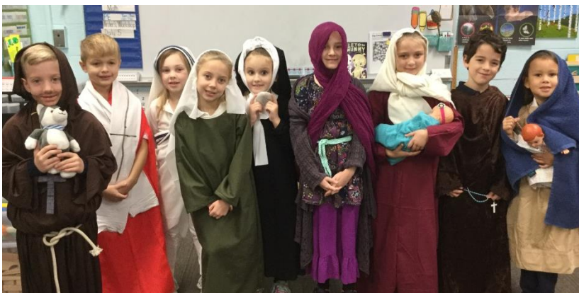
Some of our 1st graders from their All Saints Day parade.