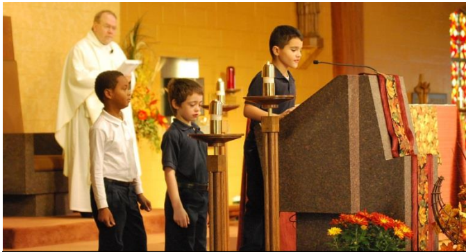
All School Masses where students in various grades lead the liturgy.